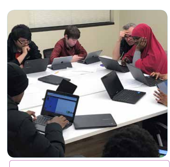
STUDENTS LEARN VARIOUS CODING LANGUAGES AT AN INDIVIDUALIZED PACE