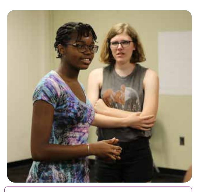
STUDENTS TAKE TURNS DOING SOLO PERFORMANCES