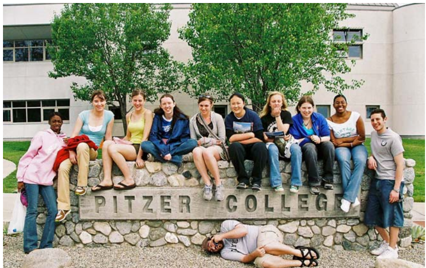
Our students got to see a variety of schools, private & public, large & small.